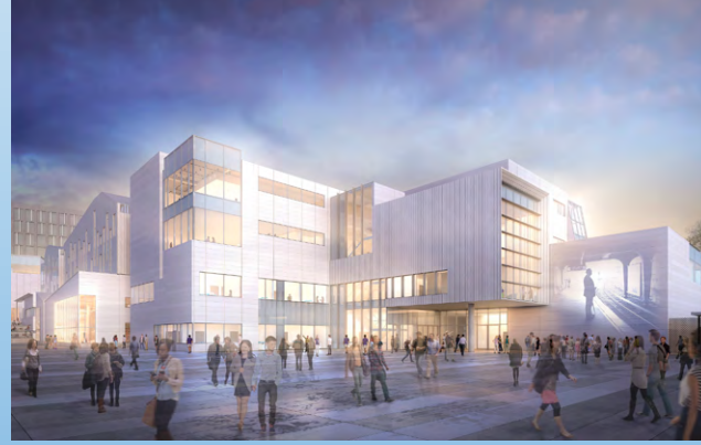
Rednering of New Emily Carr University campus

Up to $101 million for the Emily Carr University of Art + Design Redevelopment Project.