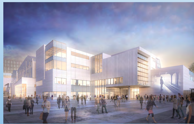
Rednering of New Emily Carr University campus